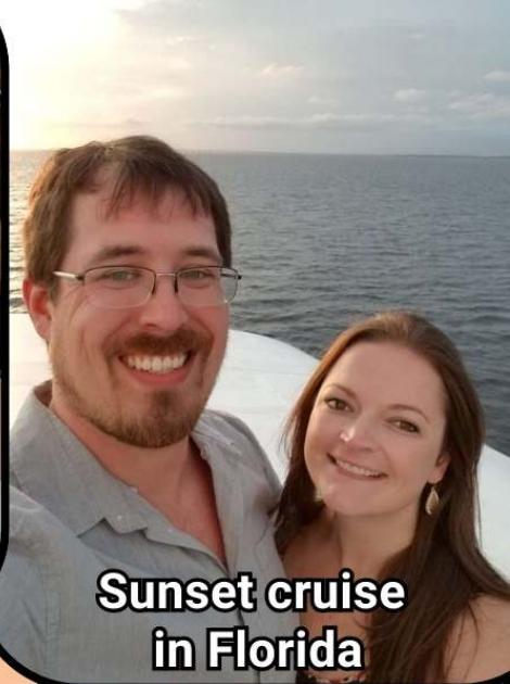
Sunset cruise in Florida