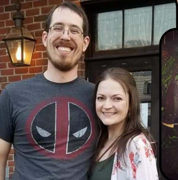
Mardi Gras in New Orleans