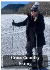
Cross Country Skiing