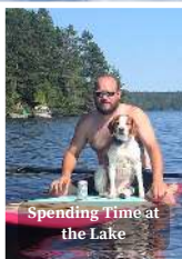
Spending Time at the Lake