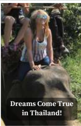
Dreams Come True in Thailand!