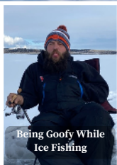
Being Goofy While Ice Fishing