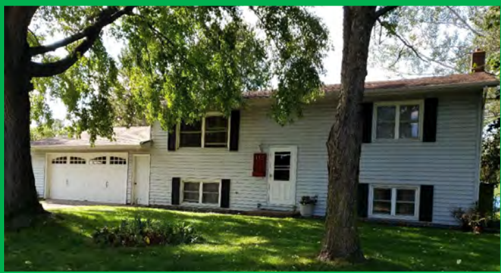
Our home, where we have access to walking trails, parks and a huge back yard