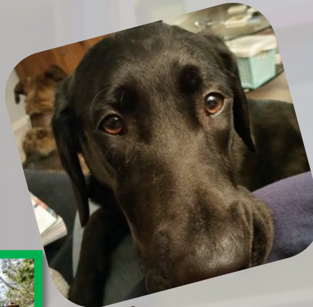
Our dog, Sapphire