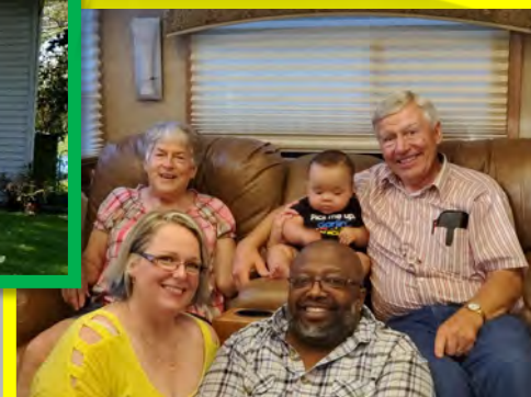
Camping and outdoor fun With both sets of grandparents and aunts