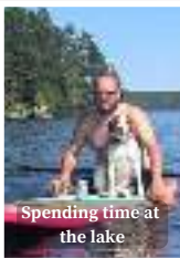
Spending time at the lake