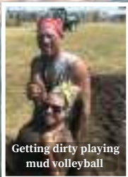
Getting dirty playing mud volleyball