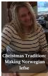
Christmas Tradition: Making Norwegian lefse