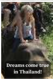
Dreams come true in Thailand!