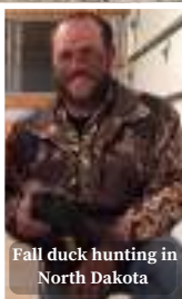
Fall duck hunting in North Dakota