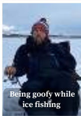
Being goofy while ice fishing