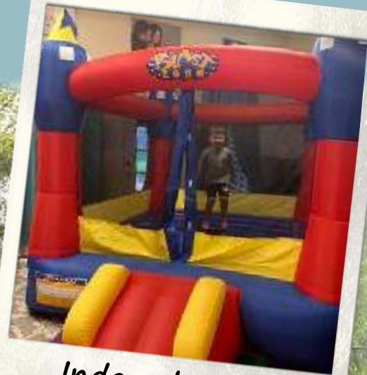
Indoor bounce house