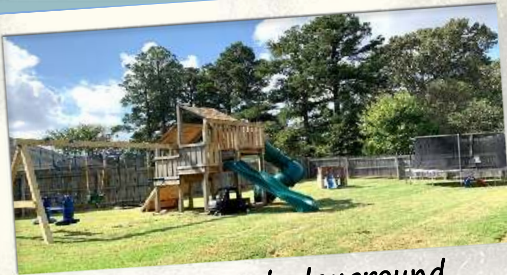
Our backyard playground

We live in a small town in Mississippi. Our home is in a cozy gated community surrounded by several parks, a fishing pond, and walking trails. One of the many reasons we choose to grow our family in Hernando was because it is considered to have one of the top schools in our area.