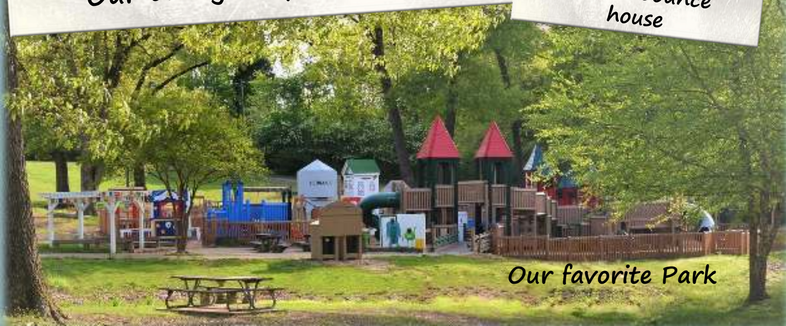
Our favorite Park