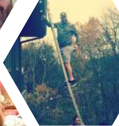
Hanging Christmas Lights