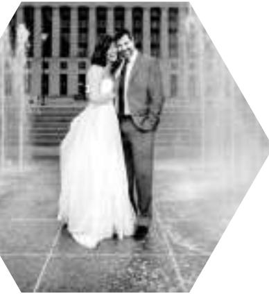
Our Wedding in 2012