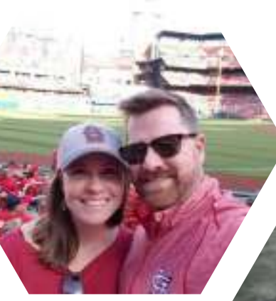
St. Louis Baseball