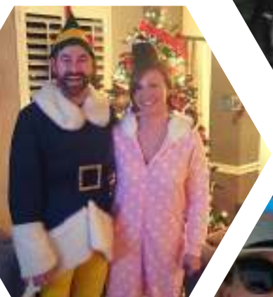
Holiday Party Fun