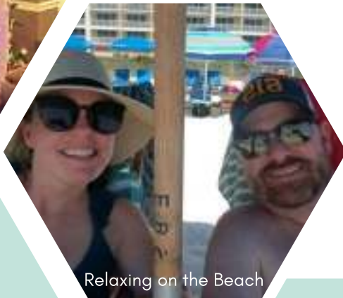
Relaxing on the Beach