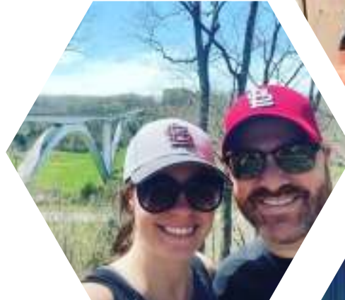
Hiking in TN