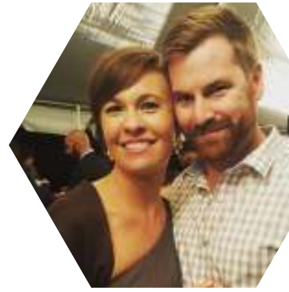
A Friends Wedding