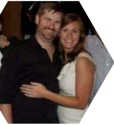
Our Rehearsal Dinner

So we want to start by saying THANK YOU! Thank you for considering us. We understand this is a hard decision and one that is likely weighing on your soul. You've made a selfless act by beginning this journey and we admire you for that already. We pray that no matter who you choose, you feel supported, encouraged and loved as this journey continues.