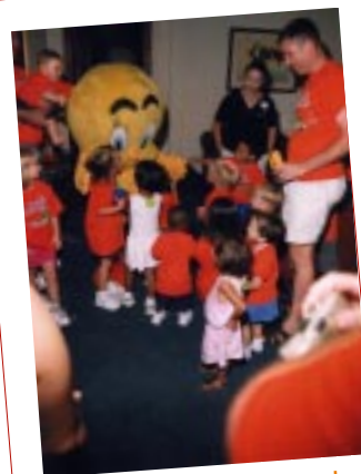
Tweety & the Abrazotots