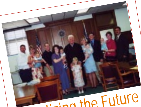
Finalizing the Future